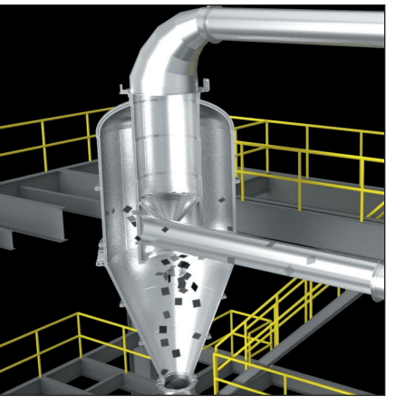
Figure 3. When the material is conveyed to the large separating chamber, air pressure is dropped to allow the material to fall into the chamber below.

Quickdraft's most recent innovation in pneumatic conveying is the all-negative aluminum conveying system, which provides the reliability and space saving benefits of the Venturi blower technology while minimizing operating horsepower requirements for energy cost savings. Using one or more blowers (depending on the material size and flow requirements), the system vacuums the material into a large separating chamber (Figure 3), where the