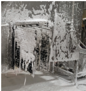
Filters foamed and cleaned without removal

The Demister XL Filtration System uses a multi-stage process of velocity reduction, change in air direction, water spray scrubbing, and demister pad filtration to filter grease, oil, breading and particulate from the exhaust air stream. There are no moving components in the demister vessel, and it is easy to clean. The filters are automatically rinsed while in production and the waste materials are continuously washed away resulting in consistent filtration performance. The internal Water Recirculation System reduces water consumption and operating costs. Demister pad filters can be completely cleaned without being fully removed from the unit. This exhaust filtration system also limits the number of roof cleanings, reduces pest control issues, extends the life of the roof and reduces maintenance costs.