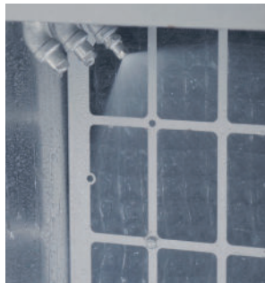
Periodic water spray